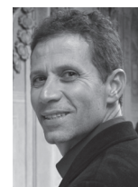
2014 | ILLUSTRATOR Roger Mello