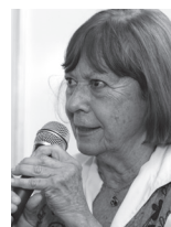
1982 | WRITER Lygia Bojunga